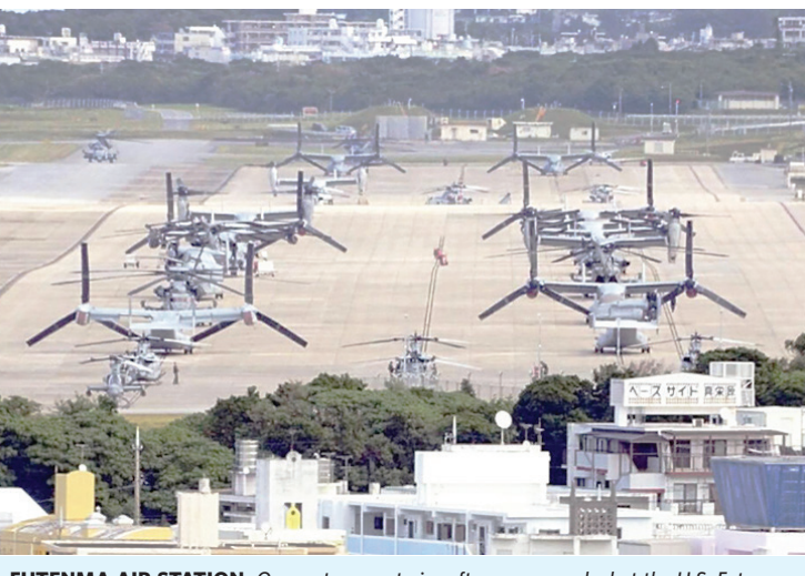
FUTENMA AIR STATION: Osprey transport aircraft are seen parked at the U.S. Futenma Air Station in December 2021.

In February, a landing craft approached the U.S. military's Kin Blue Beach Training Area in the town of Kin. A drill was conducted in a setting where a beach here was a