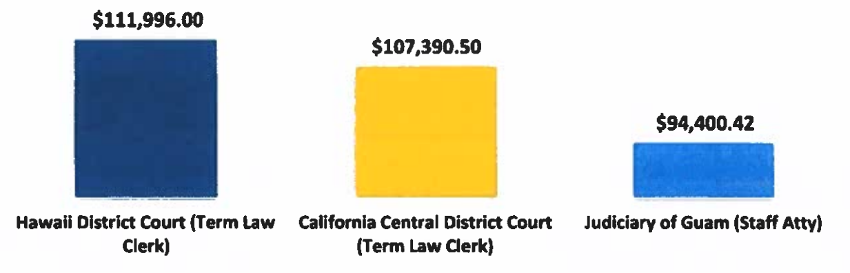
Table 7. External Comparison (Hawaii, California & Judiciary of Guam)

The chart illustrates that the Judiciary's Staff Attorney is compensated well below Term Law Clerks in Hawaii and California, more specifically 19% and 14% respectively.