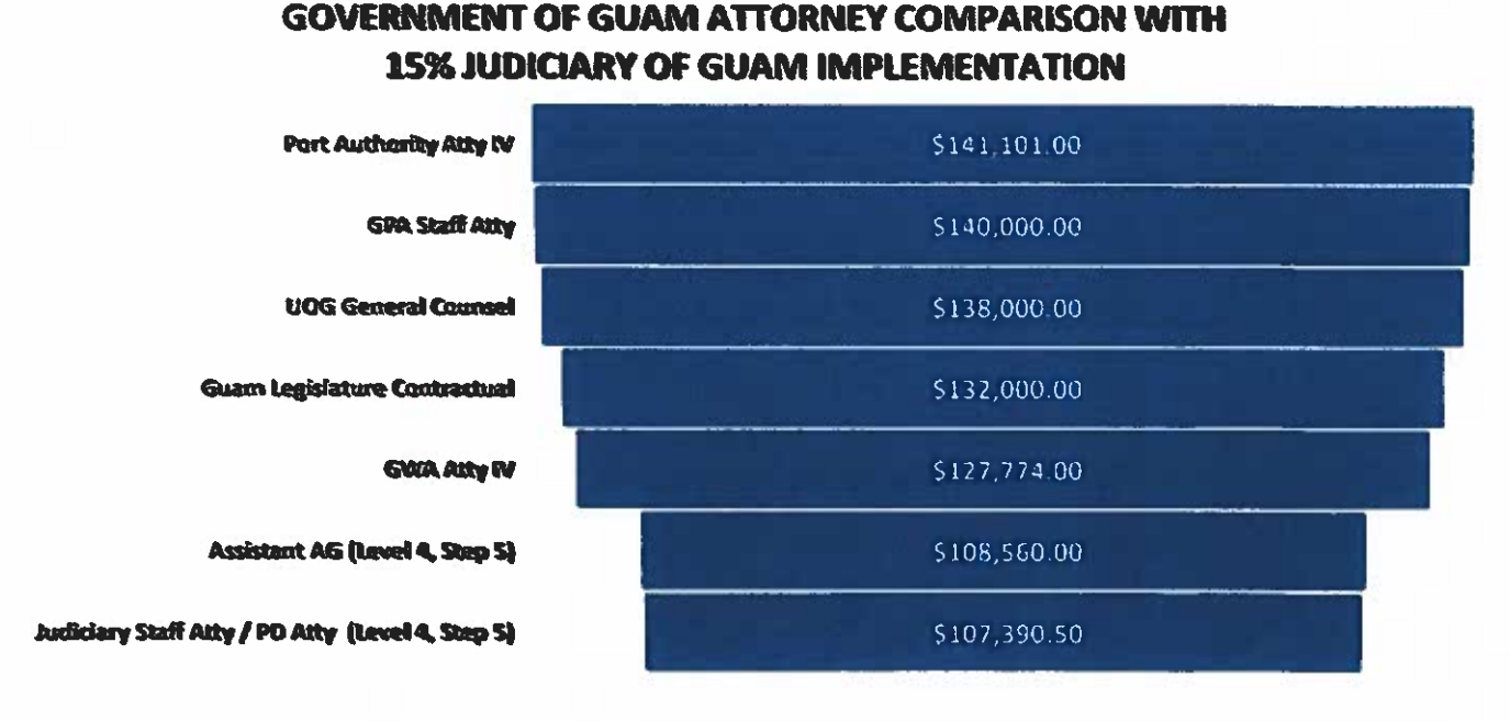
Table 8. Government of Guam Attorney Comparison upon Implementation

In closing, the Attorney Pay Plan is a recruitment and retention tool for the Judiciary and with a limited pool, as an employer, our salaries must stay competitive.